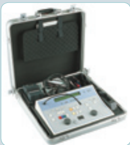
Hard shell carrying case