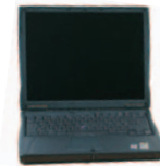
Software for PC: IaBaseII NOAH Modules