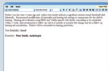
Report page from the Diagnostic Suite (AS608e only)