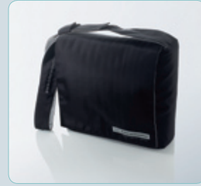
Dedicated carrying bag

The AS608 / AS608e includes a dedicated, light-weight carrying bag with shoulder strap that will accommodate the AS608 / AS608e, headset, and audiogram charts.