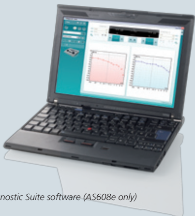
Diagnostic Suite software (AS608e only)

The AS608e includes the Hughson Westlake automatic pure tone test procedure. When the test is completed the results are easily recalled from the internal memory of the AS608e and displayed in the Diagnostic Suite PC software.